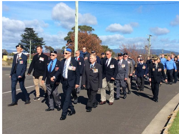
Many from the community at the 11am service.