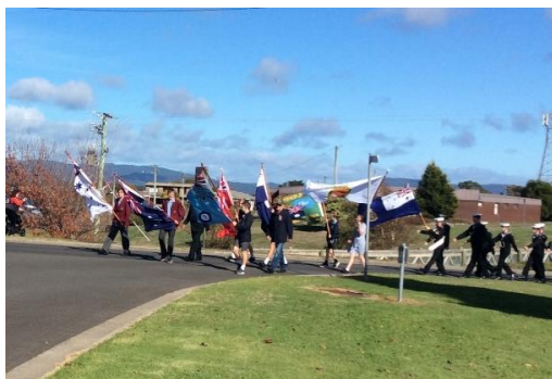
Parade entering Anzac Drive